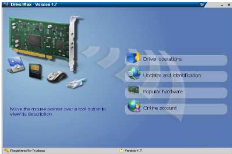
Figure 4 – The DriverMax Main Window